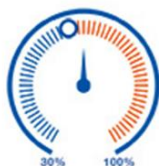
Full DC Inverter