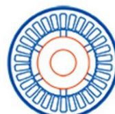
DC Brushless motor